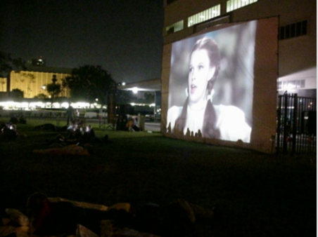
Cinema 1000 For huge cinematic presentations. $5000 to $50,000

At this level, your movie experience will have custom designed sound, screens, and projection.